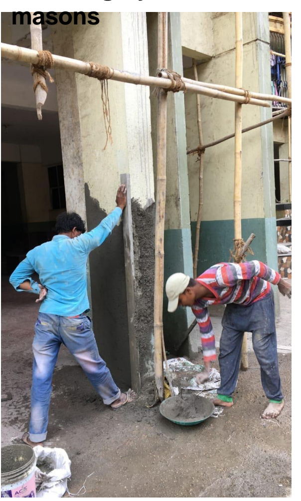
Step-5: Finishing by skilled