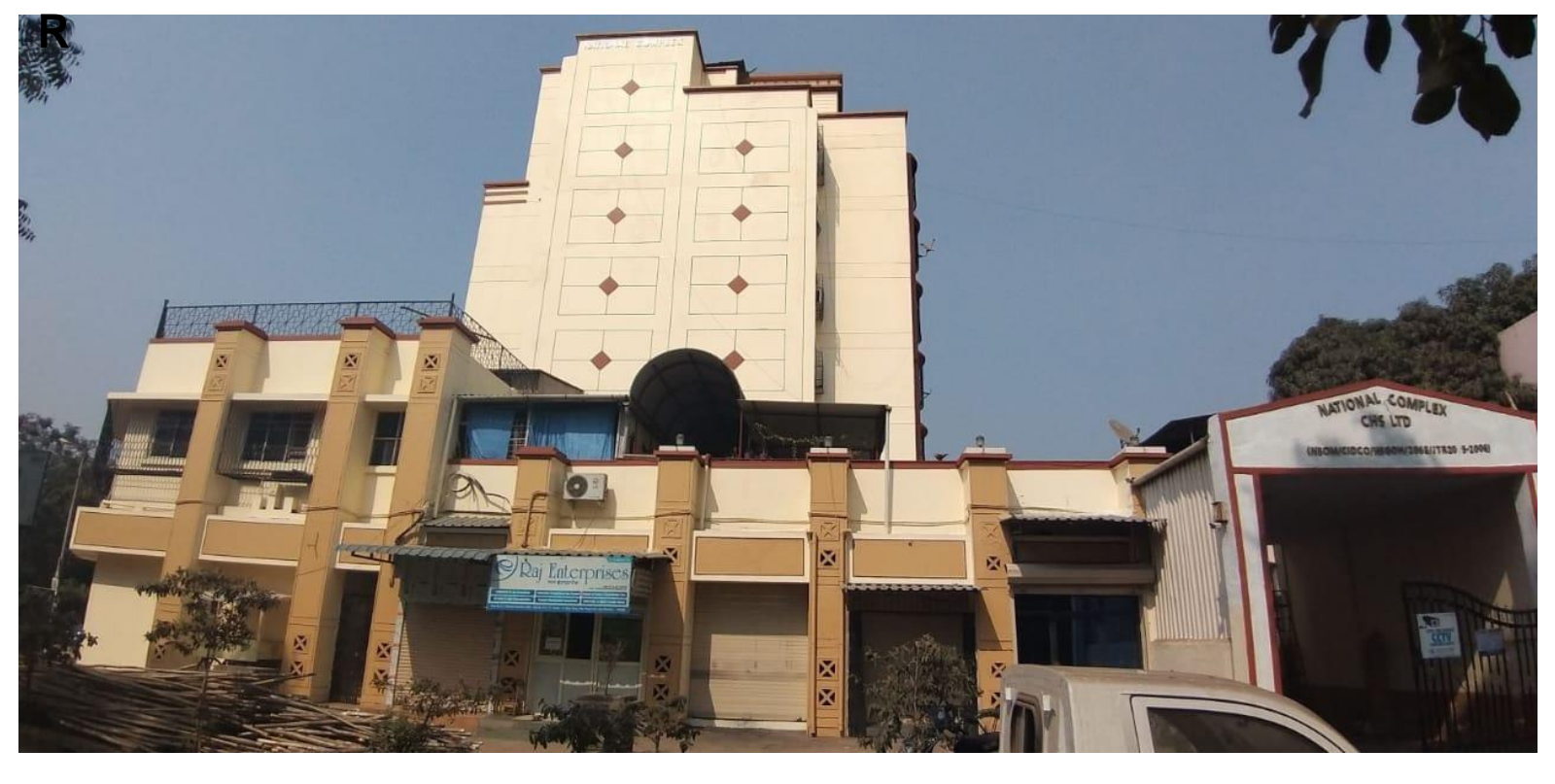
Recall & Trust value at its best! Work done in 2011 was so good that they called us again