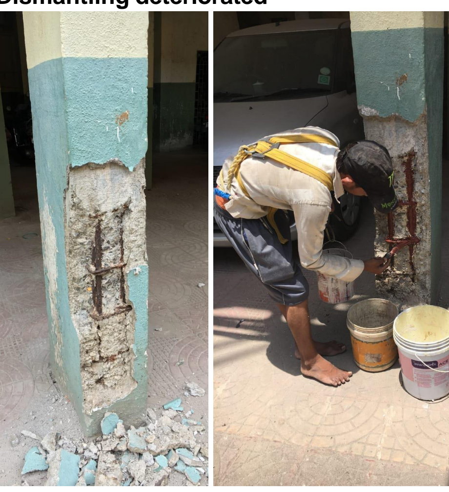
Step-1: Dismantling deteriorated